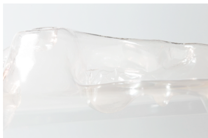
Plastics 8324 (Clamshell)