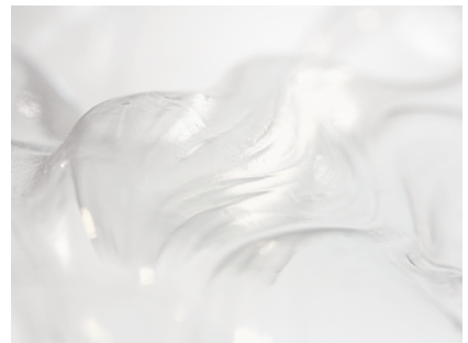
Plastics 7010 (Clamshell)