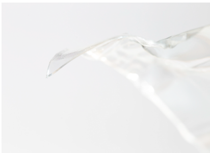
Plastics 8533 (Clamshell)