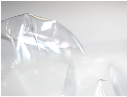
Plastics 8187 (Parallax)