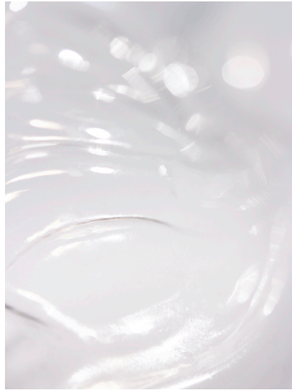
Plastics 7028 (Clamshell)