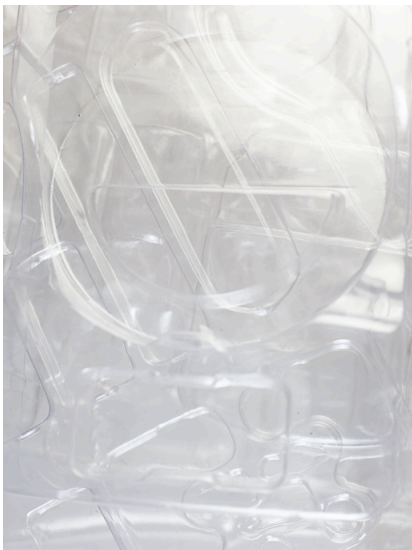
Plastics 9594 (Surplus)