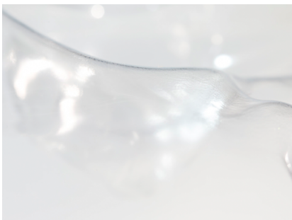
Plastics 8366 (Clamshell)