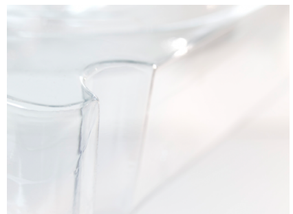
Plastics 7776 (Clamshell)