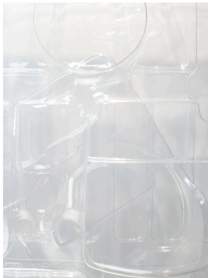
Plastics 9597 (Surplus)