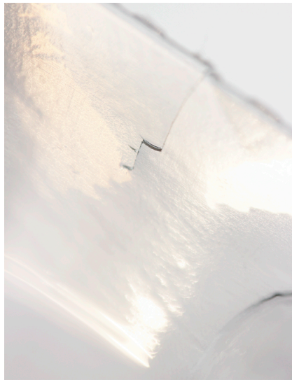
Plastics 7040 (Clamshell)