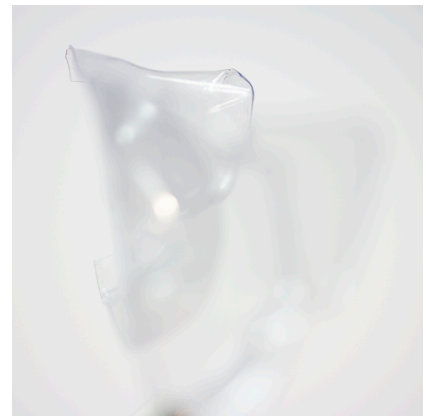
Plastics 6422-3/3 (Clamshell)