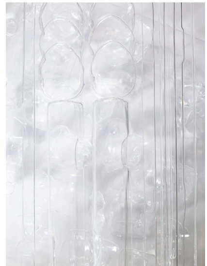
Plastics 9609 (Surplus)