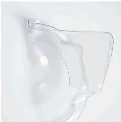
Plastics 6416-1/3 (Clamshell)