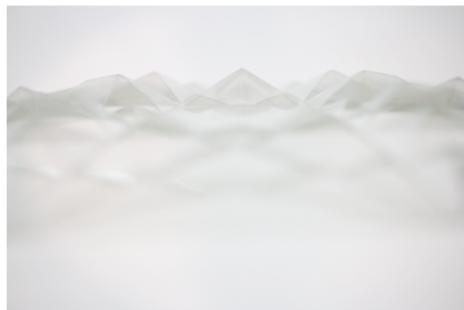
Plastics 6411 (Clamshell)