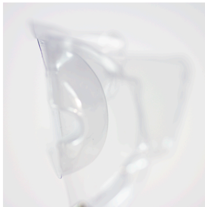
Plastics 6419-2/3 (Clamshell)