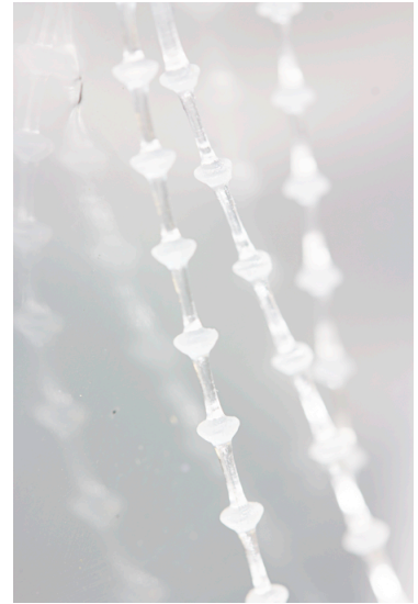
Plastics 6596 (Clamshell)